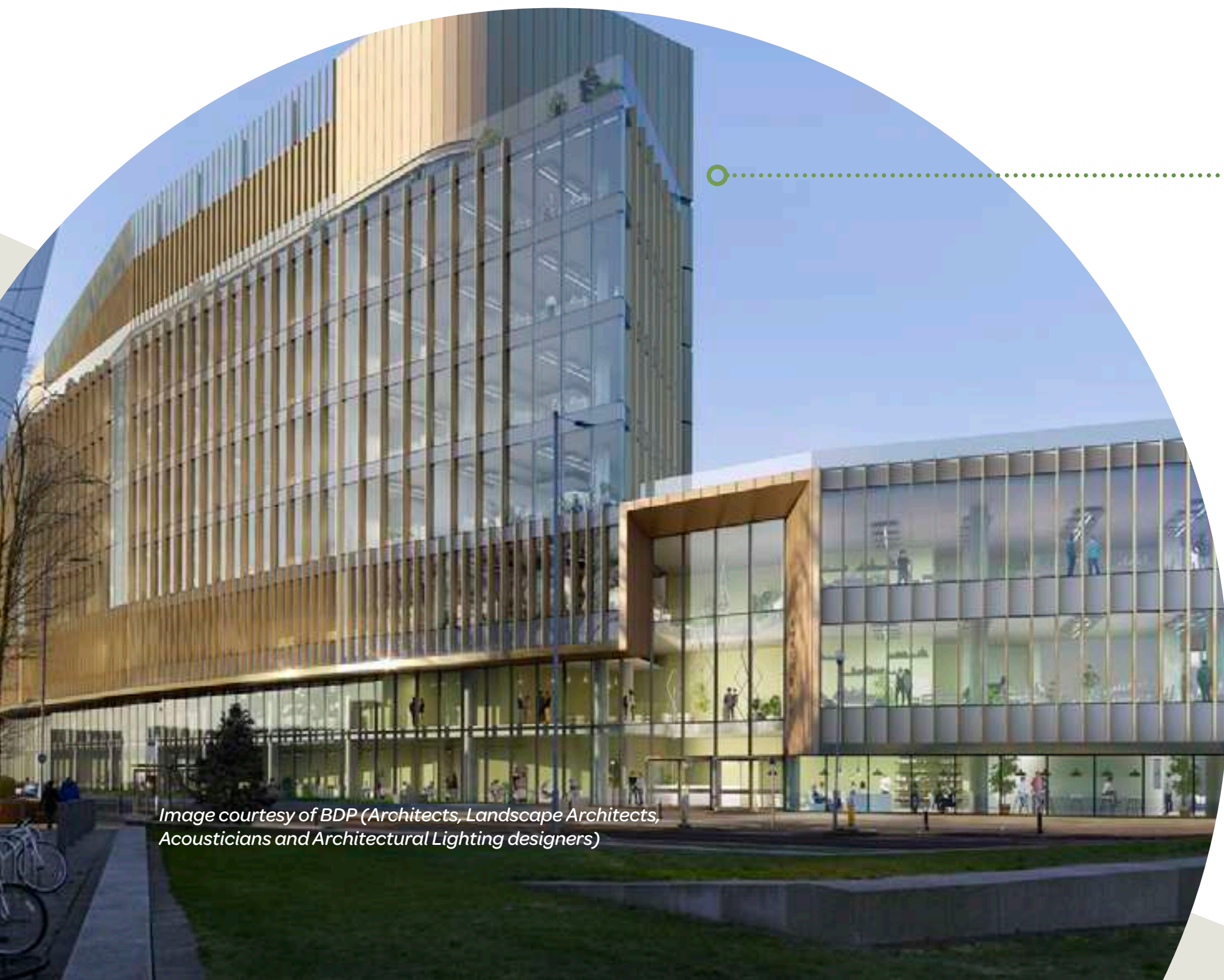
Image courtesy of BDP (Architects, Landscape Architects, Acousticians and Architectural Lighting designers)

Planning, Strategic Communications, Design, Heritage & Townscape, Sustainability, Economics